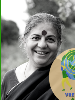
Mission 1, Level 1