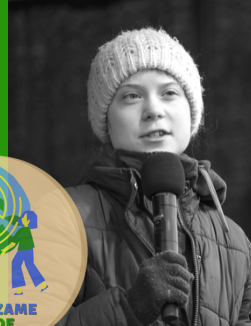
Mission 3, Level 1