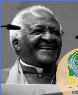
Mission 7, Level 3