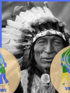
Mission 8, Level 3