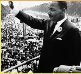
Mission 5, Level 2