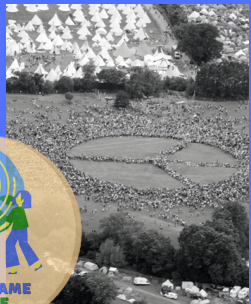
Mission 9, Level 3