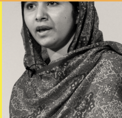
Mission 6, Level 2