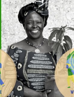
Mission 2, Level 1