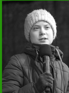
Mission 3, Level 1