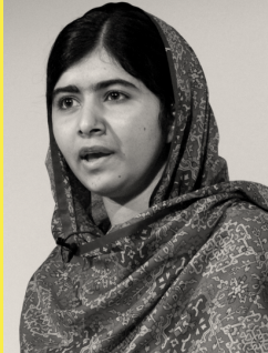
Mission 6, Level 2