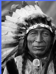
Mission 8, Level 3