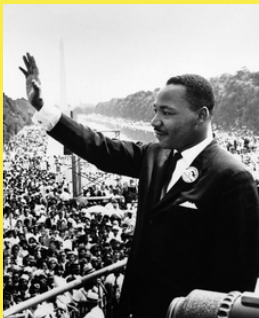
Mission 5, Level 2