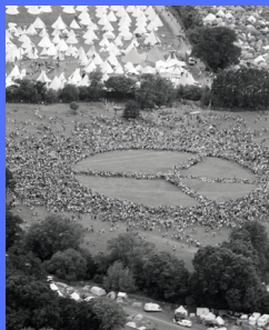
Mission 9, Level 3