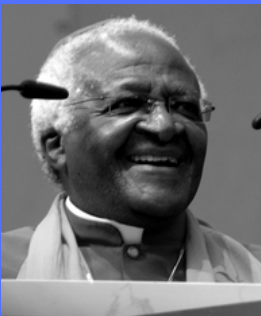
Mission 7, Level 3