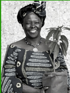
Mission 2, Level 1