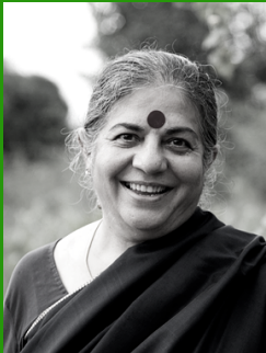
Mission 1, Level 1